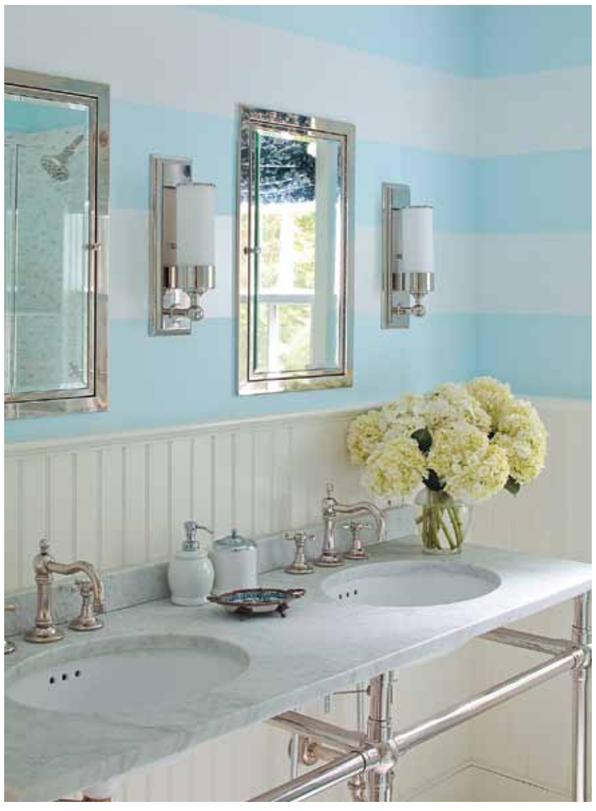
THOUGH THE HOUSE MEASURED ONLY 675 SQUARE FEET, THE COUPLE SAW PURE POTENTIAL. "WE ENVISIONED OUR OWN MINI HAMPTONS COMPOUND, A PRIVATE LITTLE OASIS"