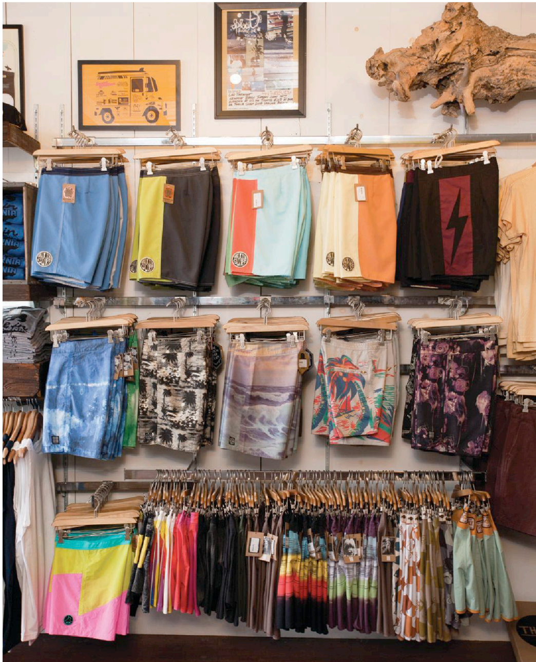
THALIA SURF SHOP ▲