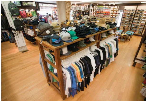
▲ LAGUNA SURF AND SPORT