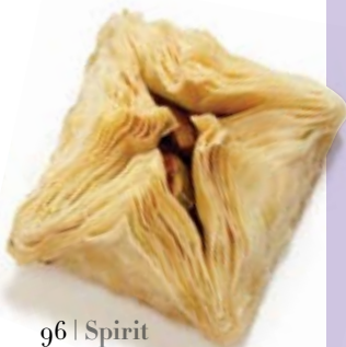
96 | Spirit

Spend extra time in the area by overnighting at the historic Dearborn Inn . dearborninnmarriott.com