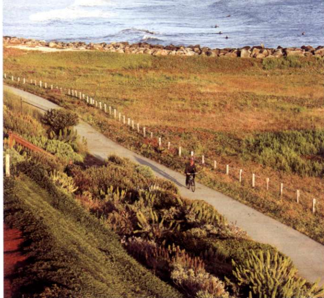
Clockwise from top left: From seagull sightings in tide pools, biking through scenic coastal trails, to relishing exquisite wines at Fogarty, San Mateo County offers you a variety of leisure options.

Just a few miles from Filoli on Skyline Boulevard (Highway 35), one finds the Thomas' Fogarty Winery and Vineyard (19501 Skyline; tel. +1-650-851-6777; www.fogartywinery.com), right at the northern end of the Santa Cruz Mountains Appellation and one of the peninsula's most renowned wineries. Perched atop the mountains at a 2,000-foot elevation, the property boasts some of the most dramatic views of the entire Bay Area. An appellation known throughout the world as a first class wine region, the area perfectly suits Fogarty, which is known for its complex and robust Pinot Noirs.