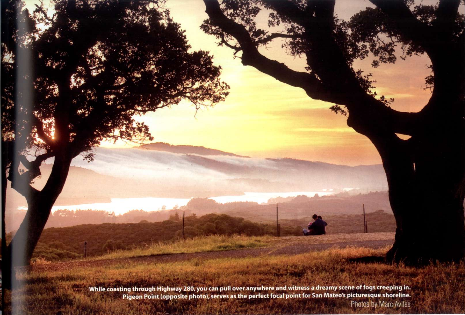
While coasting through Highway 280, you can pull over anywhere and witness a dreamy scene of fogs creeping in. Pigeon Point (opposite photo), serves as the perfect focal point for San Mateo's picturesque shoreline.