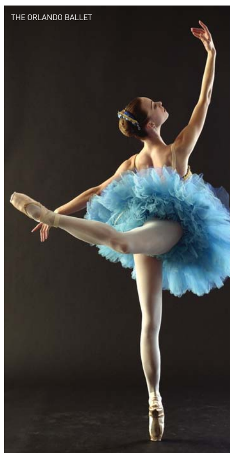
THE ORLANDO BALLET

graphics, photos, sculptures and objets d'art . The surrealism begins even before you walk through the door.