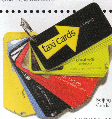
Beijing Taxi Cards.

Beijing Taxi Cards , an ingenious new palm-size guide to help you navigate through this year's Olympic city, are replete with photographs, Chinese characters, and a phonetic pronunciation key for eating and drinking hot spots, shopping, Olympic venues, and more. The cards come in nine languages and are available at beijingtaxicards.com .