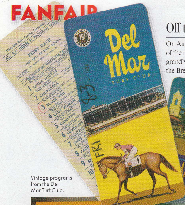
Vintage programs from the Del Mar Turf Club.