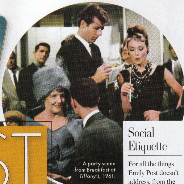
A party scene from Breakfast at Tiffany's , 1961.

On August 24, Southern California's seaside Del Mar racetrack, once the summer playground of the rich and famous, hosts the 18th annual Pacific Classic Stakes , which concludes grandly with a million-dollar purse. Winners and losers agree that the event, a preparation for the Breeders' Cup Classic, makes for a delicious afternoon in the sun. (delmarracing.com)