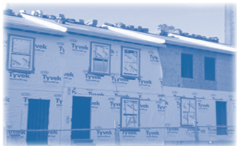
Miller's Row, Winter 2008

These other crucial sponsors of the Miller's Row project are DuPont ($100,000), CitiGroup, who donated $70,000, and JPMorgan Chase ($50,000). Additional Valued Sponsors include Nuclear Electric Insurance, Youth United Schools, and Citizens Bank, Deutsch Bank & Trust Company-Delaware, AstraZeneca; as well as Landmark Engineering and J & L Building Supply who donated materials In-Kind and/or Services.