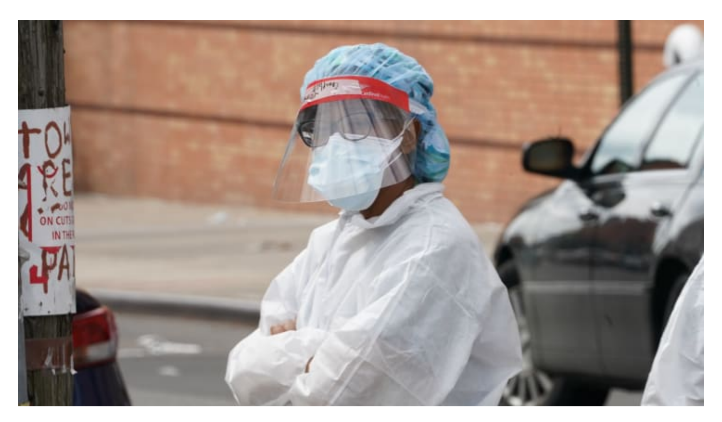
A member of the medical staff takes break outside Wyckoff Hospital in the Borough of Brooklyn on April 4, 2020 in New York.

Supporting workers with mental health services is not only an ethical obligation for employers, it's also a bottom-line issue.