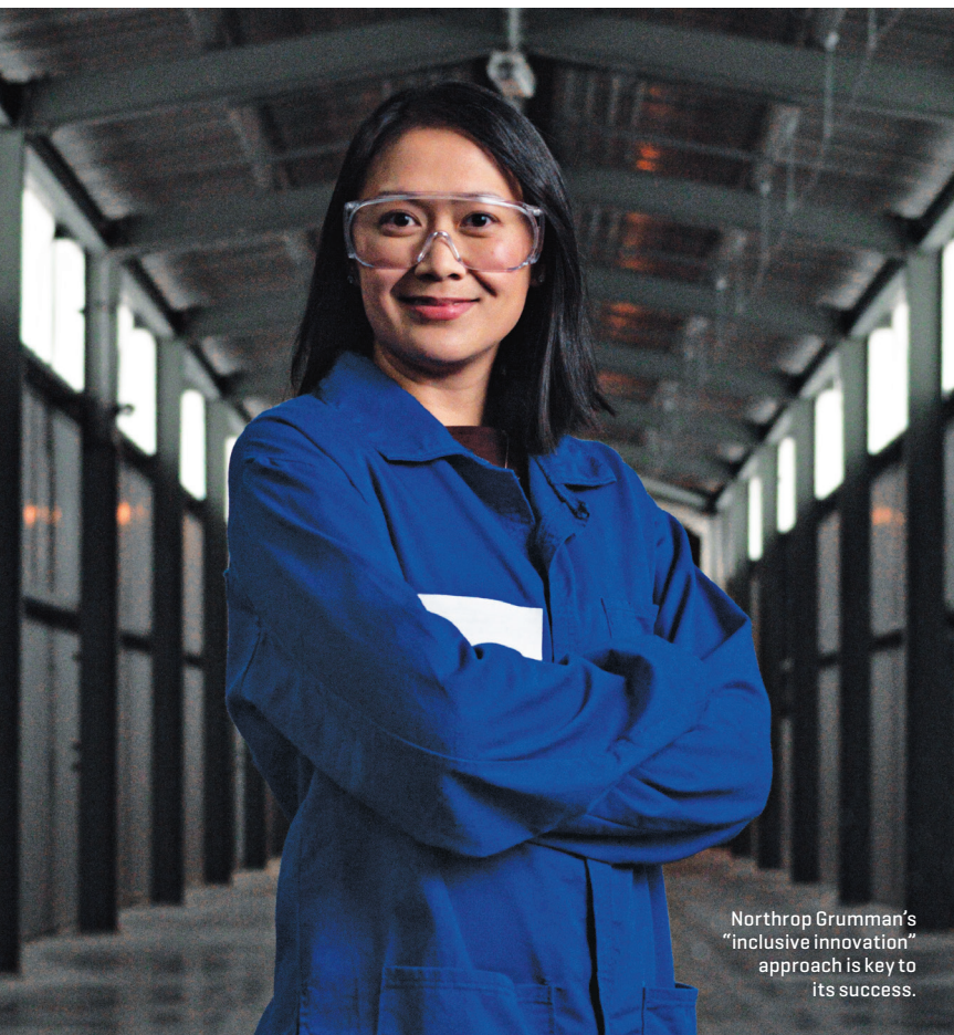
Northrop Grumman's "inclusive innovation" approach is key to its success.