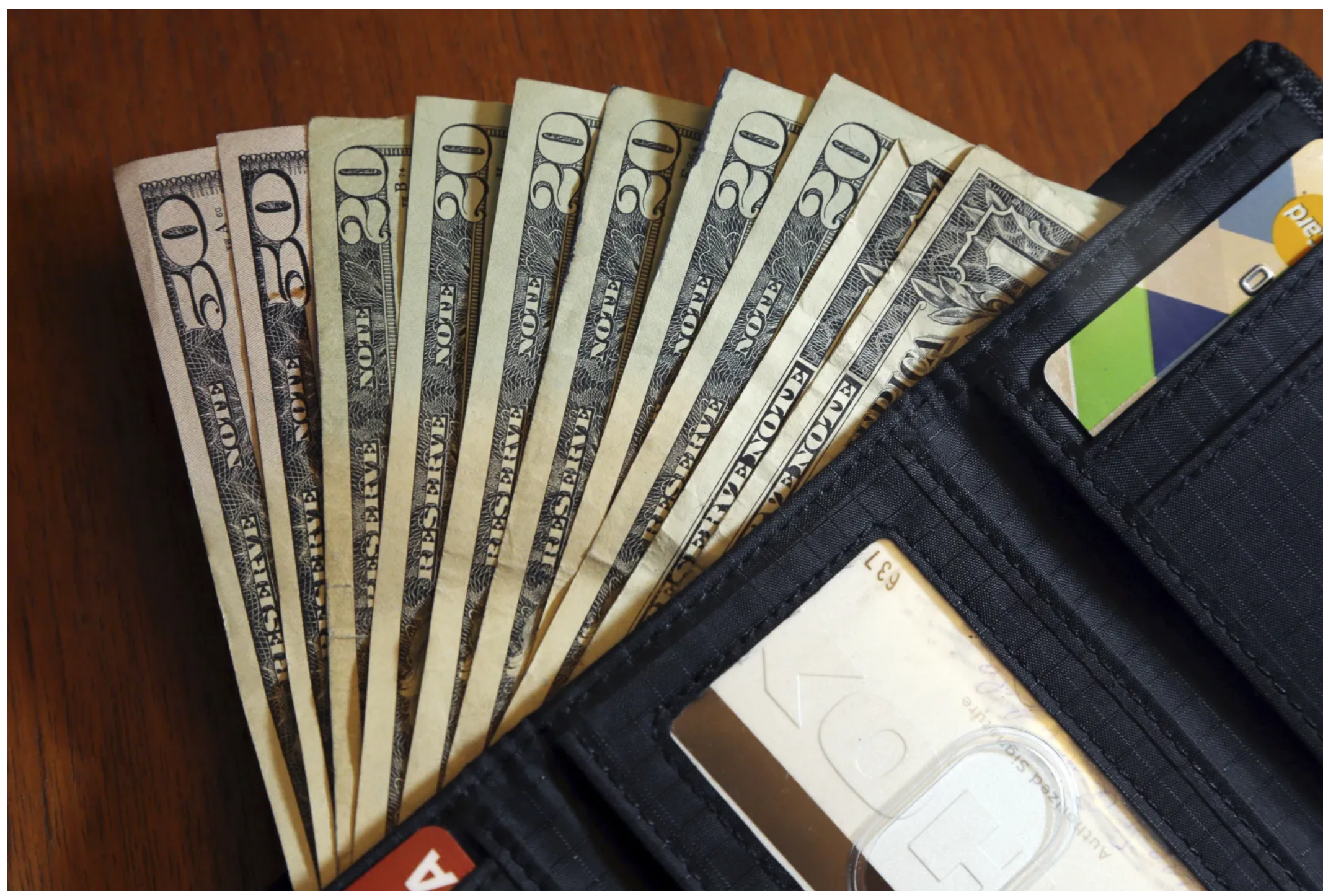
Make unexpected cash from a bonus, tax refund or other windfall last longer.