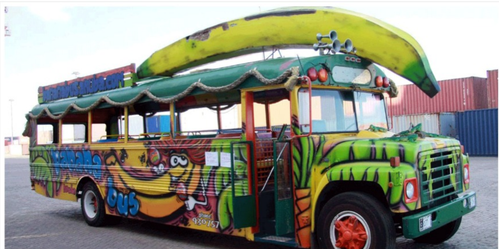
Aruba: Hop on an Aruba Pub Crawl