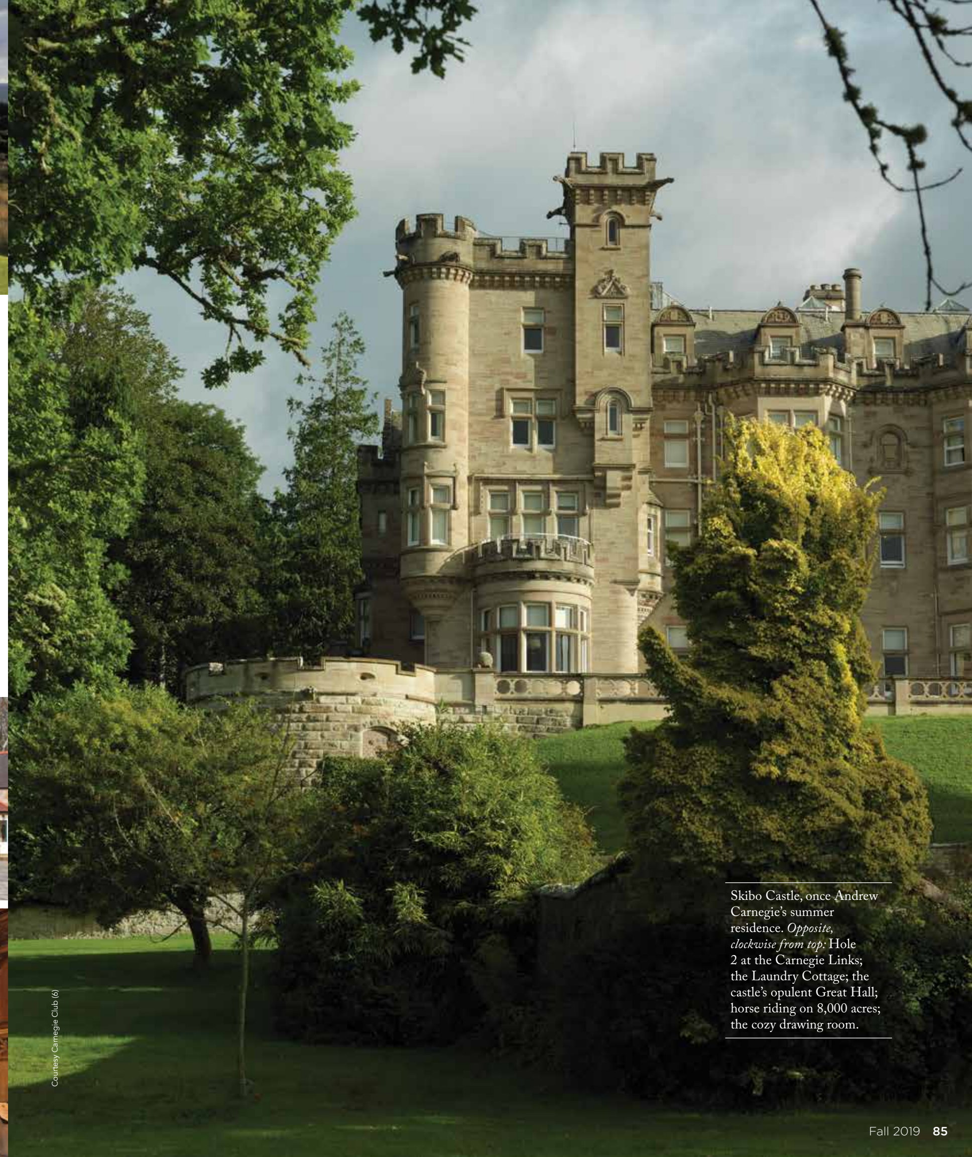
Skibo Castle, once Andrew Carnegie's summer residence. Opposite, clockwise from top: Hole 2 at the Carnegie Links; the Laundry Cottage; the castle's opulent Great Hall; horse riding on 8,000 acres; the cozy drawing room.