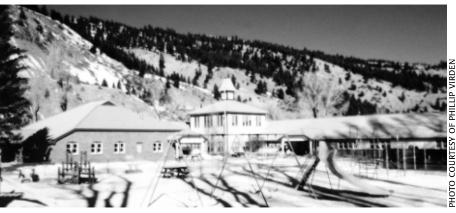
Lake City's new school.

hometown gym; when it doesn't enjoy its students performing in musical events, a community begins to lose a