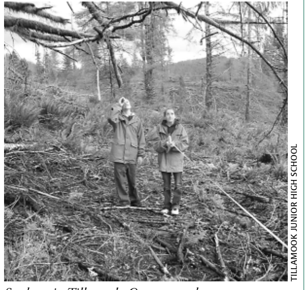
Students in Tillamook, Oregon, conduct a snag survey.

merica's educational establishment is preoccupied with test scores and the No Child Left Behind Act, with its new testing requirements and sanctions, is just the latest pressure on teachers and their students to achieve—or else. For many teachers, the response will be to "teach to the test," drilling their students to learn just the things they need to perform well.