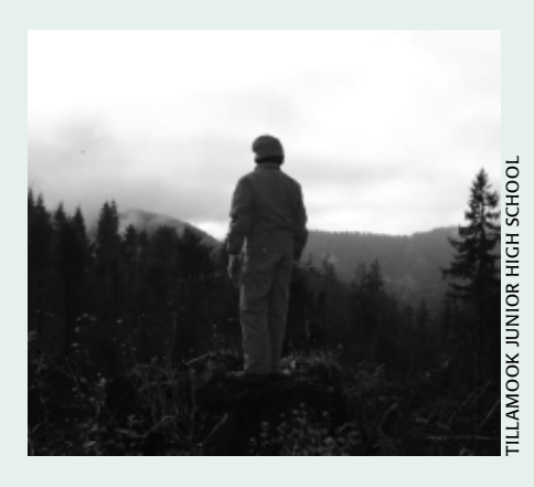
Place-based education emphasizes and provides the needed context for learning.

Place-based education emphasizes and provides the needed context for learning. It is not enough to organize