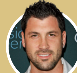
Maksim Chmerkovskiy FIRST DANCE CHOREOGRAPHY