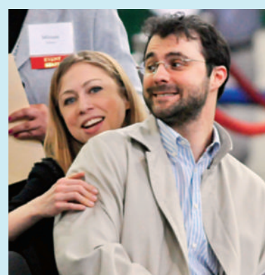
2010 "He's perfect," says a friend. "He comes from a loving family. He really has her back."