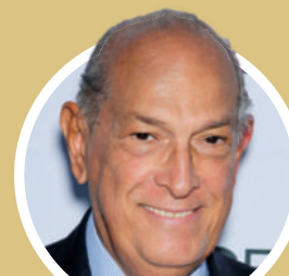
Oscar de la Renta HILLARY’S GOWN