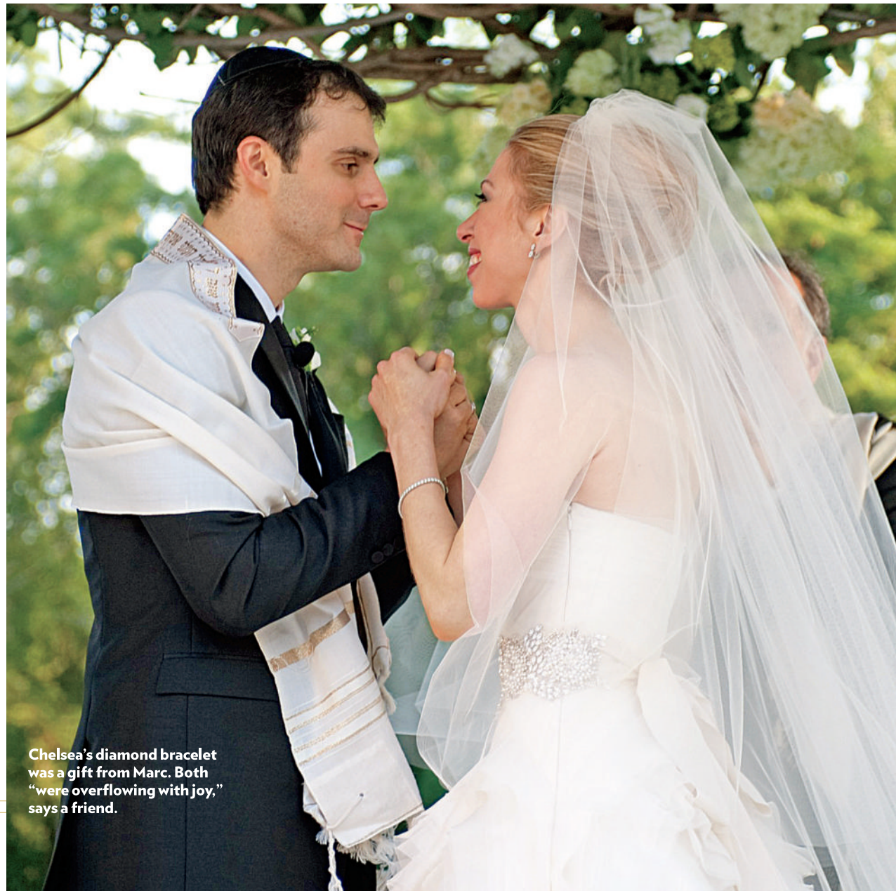
Chelsea’s diamond bracelet was a gift from Marc. Both “were overflowing with joy,” says a friend.