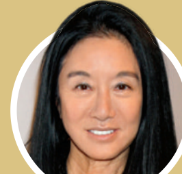
Vera Wang CHELSEA’S DRESSES