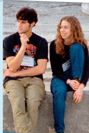
1996 Three years after meeting, the pair attended a South Carolina football game.