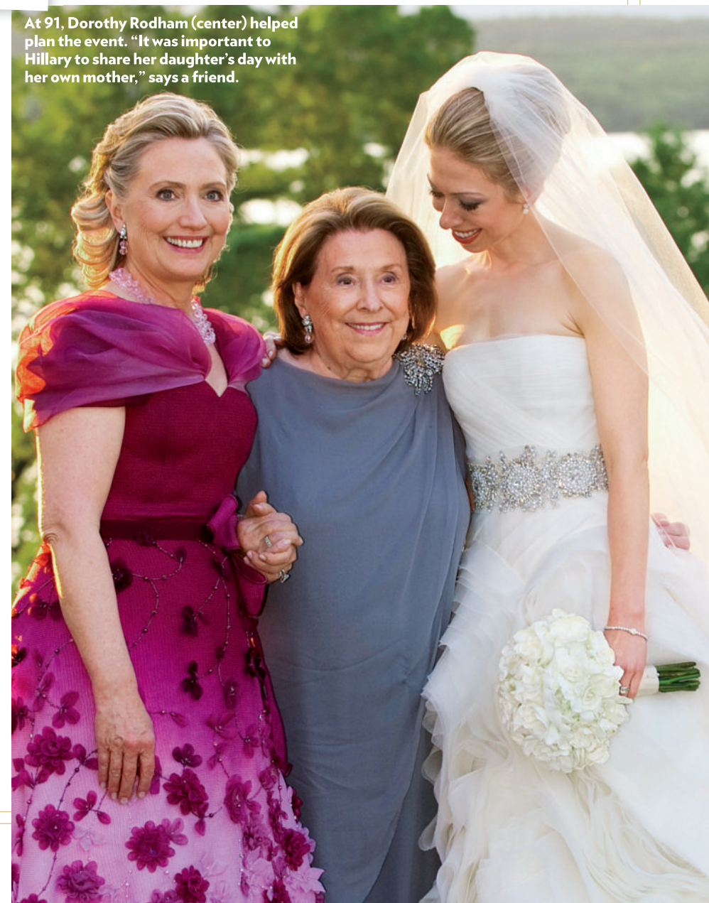
At 91, Dorothy Rodham (center) helped plan the event. "It was important to Hillary to share her daughter's day with her own mother," says a friend.

LEFT PAGE (FROM TOP): TIM ROSEKOP; DOUG WILLIAMS; AMY SANCETTA/AP; DANNY JOHNSTON/AP; RIGHT PAGE: (CLOCKWISE FROM RIGHT) BARBARA KINNEY; JEFF HOLT/LAS/FLASH NEWS; MARY ANN CHASTAIN/AP; ALEXANDRO A. ALVAREZ/PHILADELPHIA DAVID NEWS