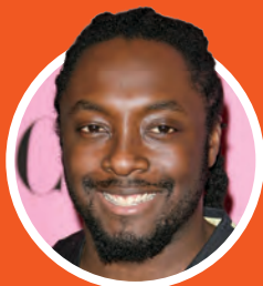
BLACK EYED PEAS