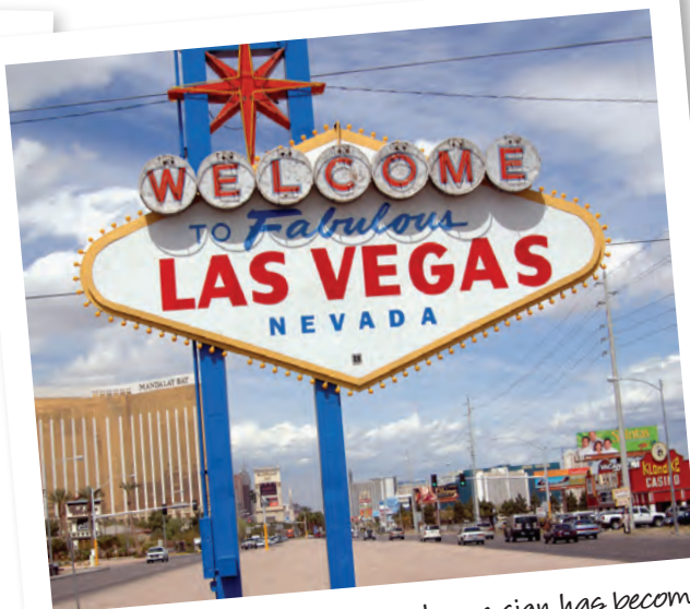
Viva Las Vegas! This 1956 welcome sign has become a Las Vegas icon.