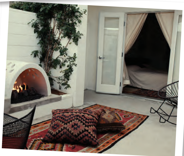
Cozy private patios? Sign us up!