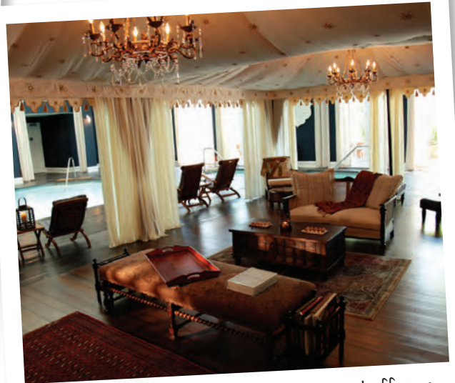
The Parker's indoor body-temperature pool offers a respite from the Palm Springs heat.