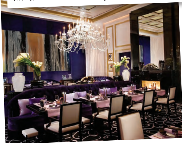
MGM Grand's luxe spot, Joël Robuchon.