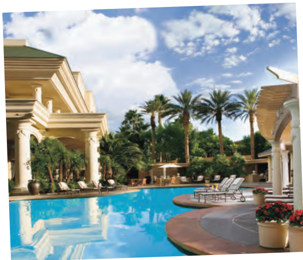
Experience how the other half lives with Four Seasons pool attendants offering a spritz of Evian, fresh fruit and chilled water. We could get used to this!