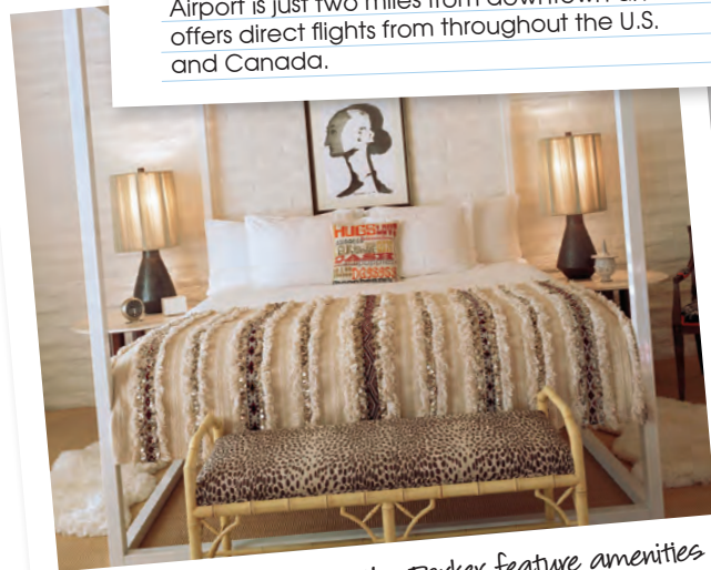
The chic guest rooms at the Parker feature amenities from Molton Brown, Jonathan Adler and Hermès.