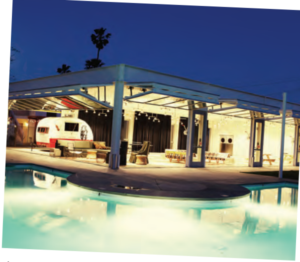
The retro-cool Ace Swim Club by moonlight.