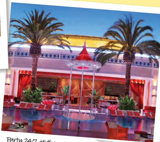
Party 24/7 at the Encore Beach Club.