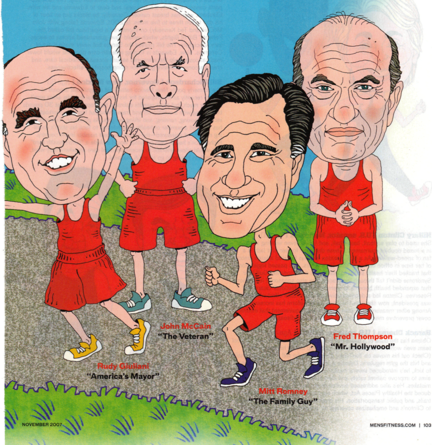
Rudy Giuliani "America's Mayor"