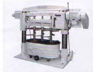
VERTICAL 3-SPINDLE DOUGH MIXER