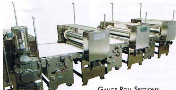
GAUGE ROLL SECTIONS