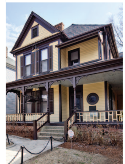
BELOW: Martin Luther King Jr. National Historic Site