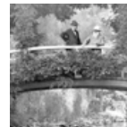
Claude Monet in his Garden at Vernon - 1922