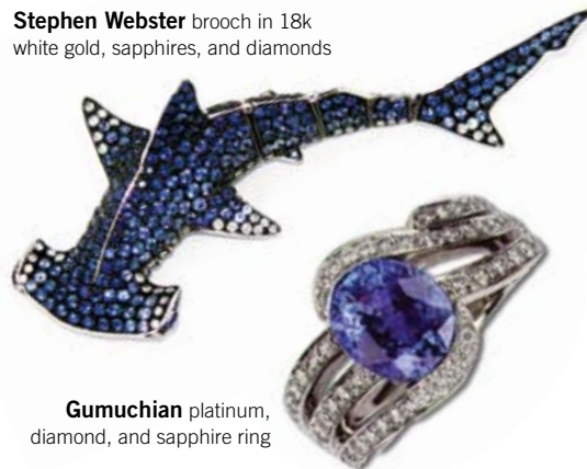
Gumuchian platinum, diamond, and sapphire ring