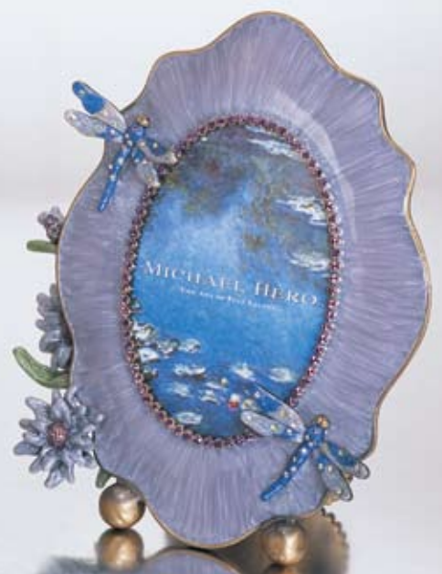
Michael Hero "Artistic Frame" collection