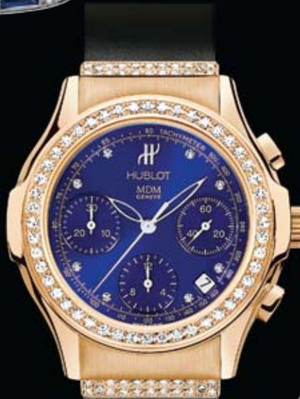
Hublot watch in pink gold with blue dial, diamonds, and rubber strap

From fashion to home decor, the color range of rich blues is quickly moving—rushing, so it seems—to be fall/holiday's primary palette. The season's ready-to-wear runways were resplendent in exciting and electric indigo, cobalt, and sapphirine—far from baby, powder, or pale blue, and more like blue ribbons, perhaps.