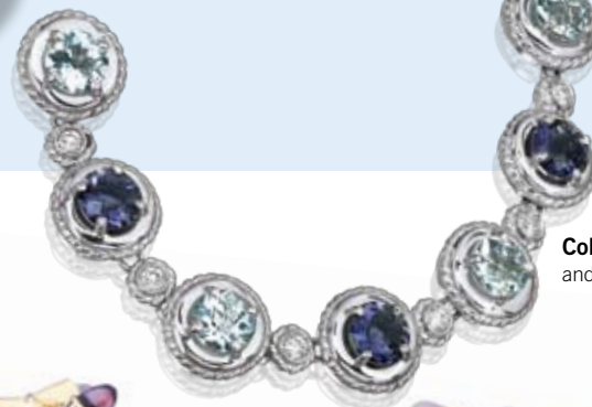
Color Story sapphire and iolite bracelet