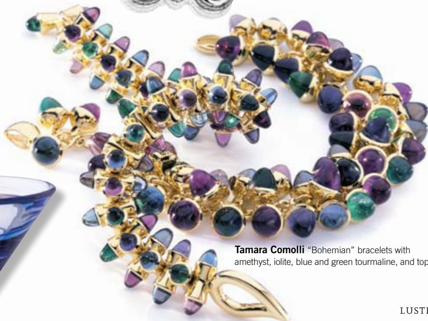
Tamara Comolli "Bohemian" bracelets with amethyst, iolite, blue and green tourmaline, and topaz