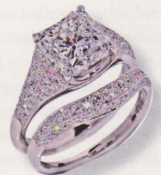
"MADISON PAVE" RINGS