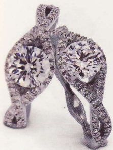
SIMPLY LAZARE™ TWISTED SHANK RINGS