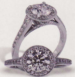
"NAOMI" RINGS FROM THE SIMPLY LAZARE™ COLLECTION