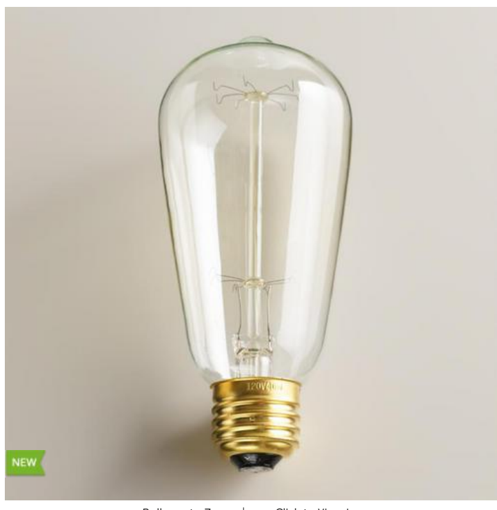
Rollover to Zoom | Click to View Larger