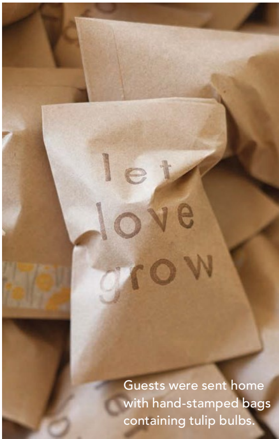
Guests were sent home with hand-stamped bags containing tulip bulbs.