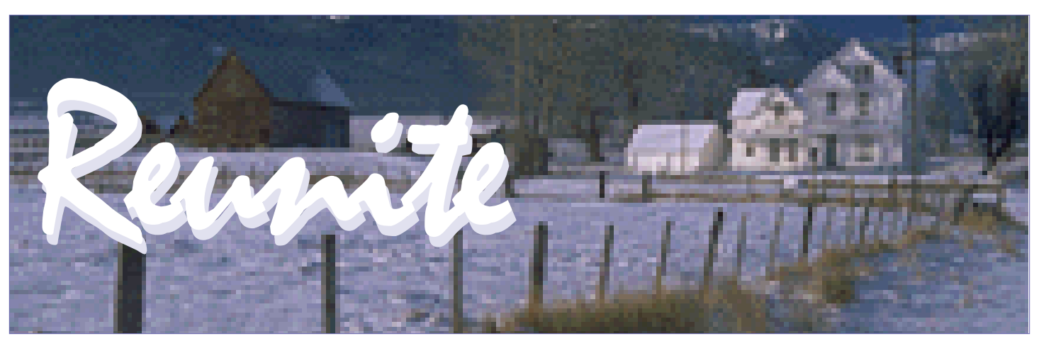
Newsletter of the Pennsylvania Adoption Reunion Registry