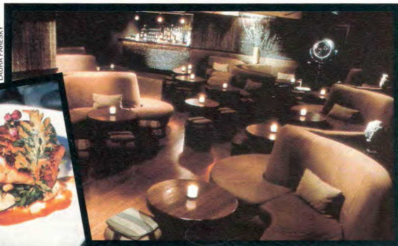
Soy-lacquered cod, left, is among the delights at Bambú, which is part-owned by actress Cameron Diaz.