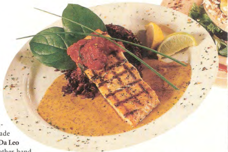
Salmon habañero, above, from Yuca, one of Lincoln Road's new breed of Cuban restaurants; Touch's inviting interior, right.

While Italy is well represented on the Road, several charming establishments pay homage to the rest of Europe's bon cuisine. La Terrasse , with its cheerful, butter-yellow decor and refreshingly friendly French staff, serves up wholesome French country fare with a couple of Moroccan dishes for an exotic flavor. Paninoteca is a sandwich shop with a European twist, serving such delights as the No. 8 special: roasted chicken breast, avocado, tomato, baby greens, Dijon mustard, balsamic