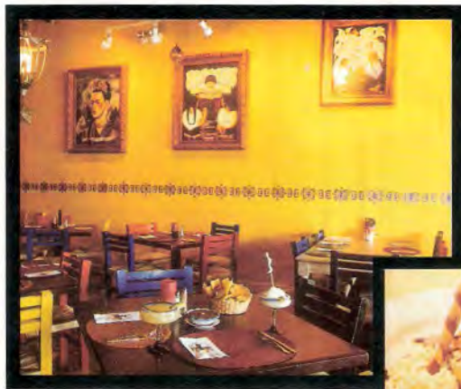
El Rancho Grande, above, serves authentic Mexican food in casual style; La Terrasse's French country fare includes wonderful dessert, right.